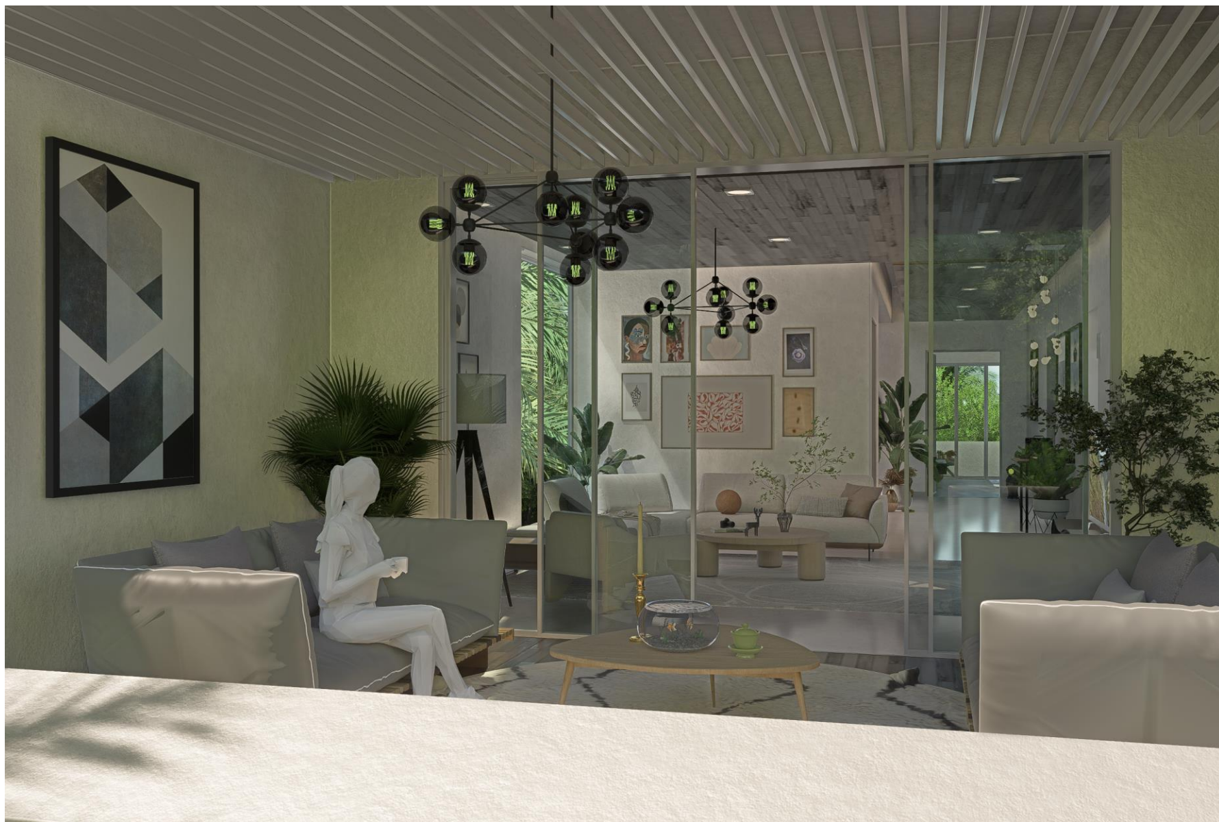
SF – BALCONY