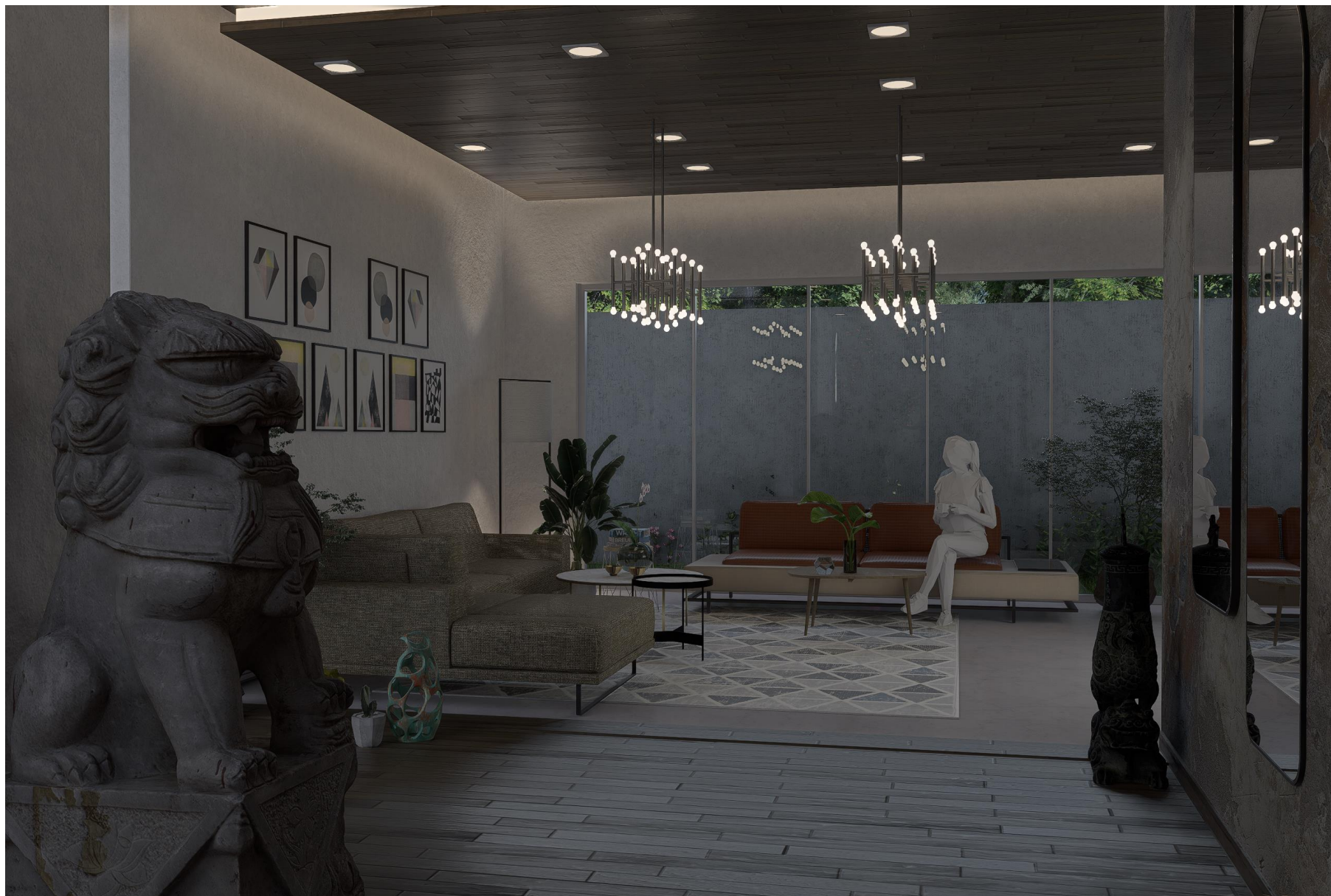
GF - LIVING ROOM