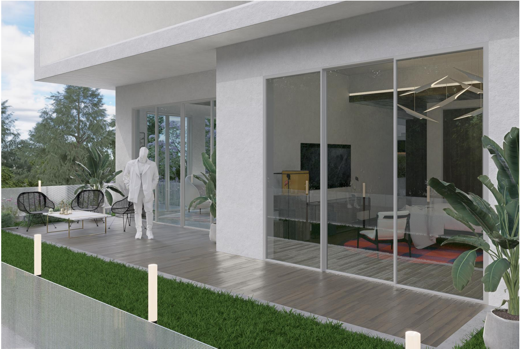
FF – OUTDOOR SEATING