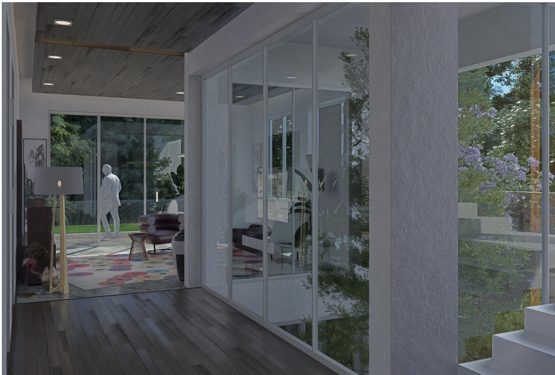
FF – CORRIDOR LANDSCAPING