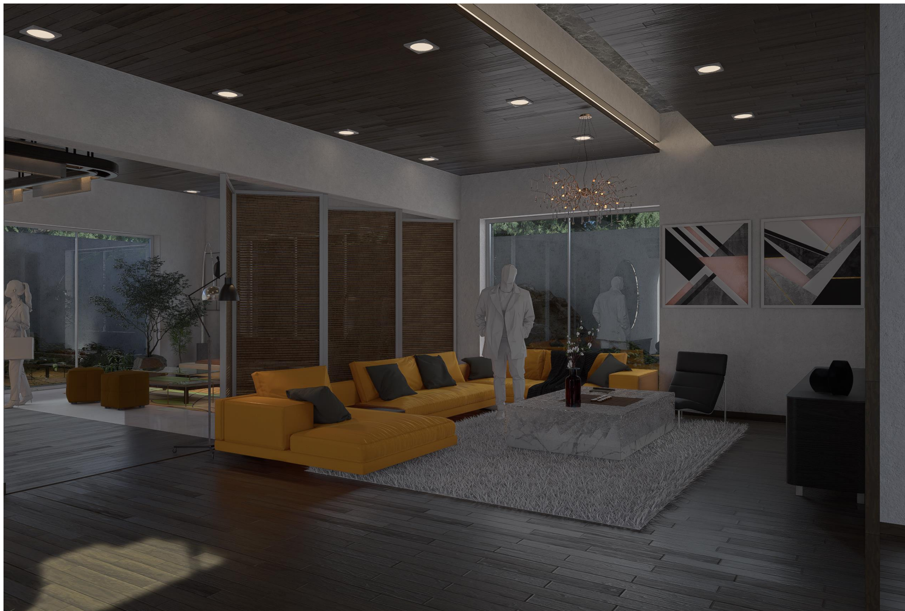
GF - FAMILY LIVING