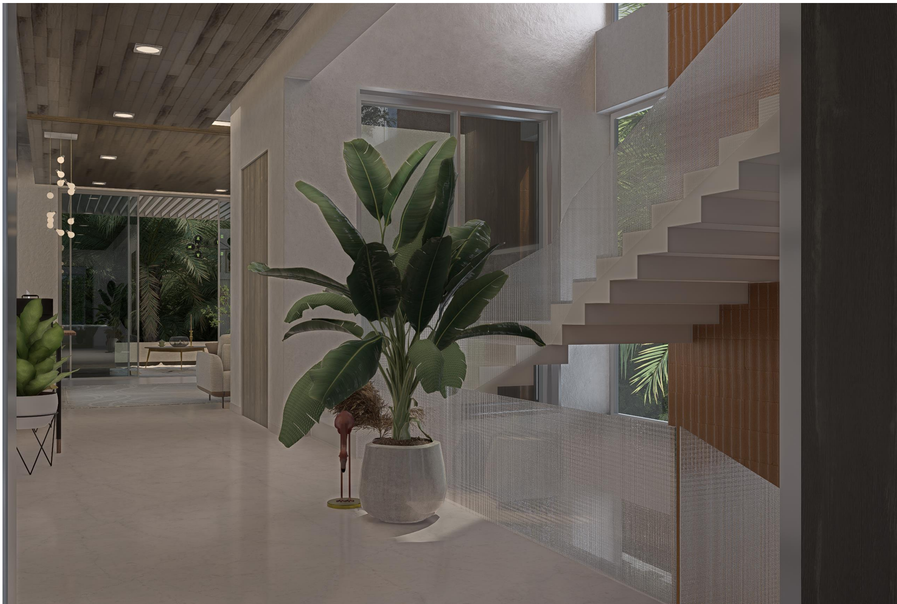
SF – CORRIDOR