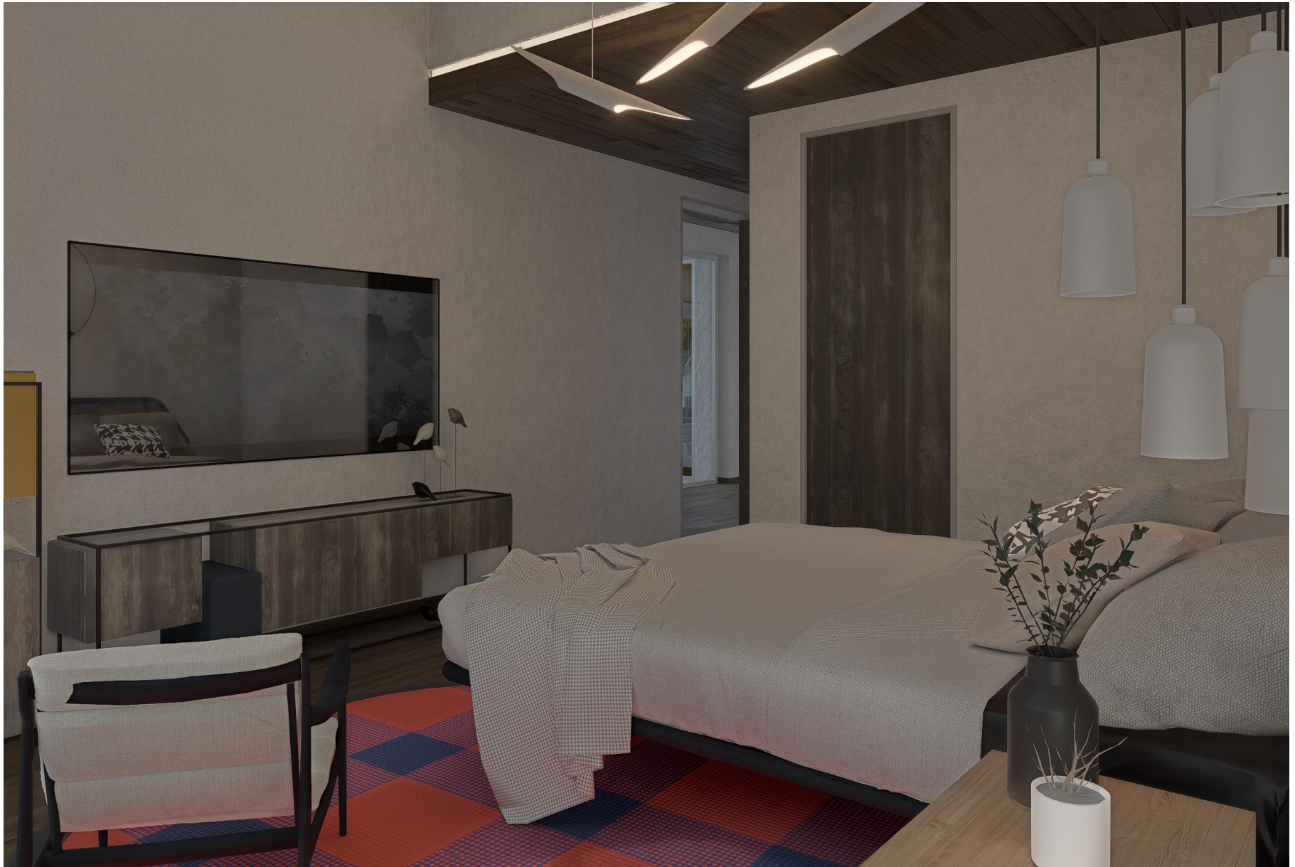
FF – GUEST BEDROOM