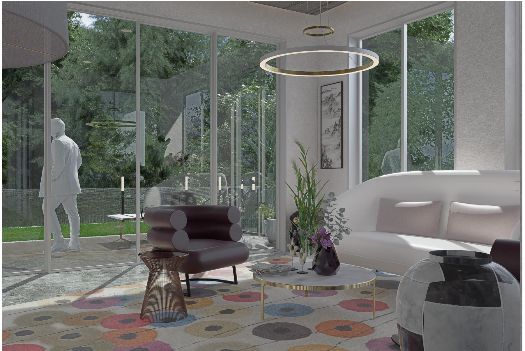
FF – FORMAL LIVING