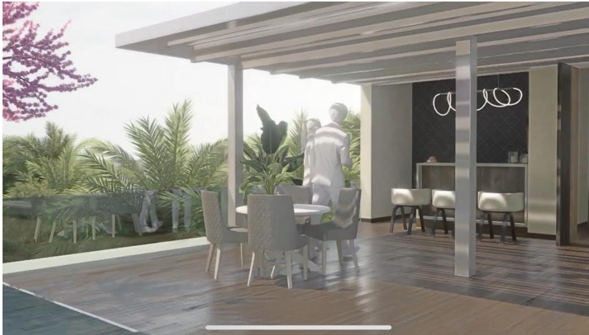
TF – TERRACE / BAR