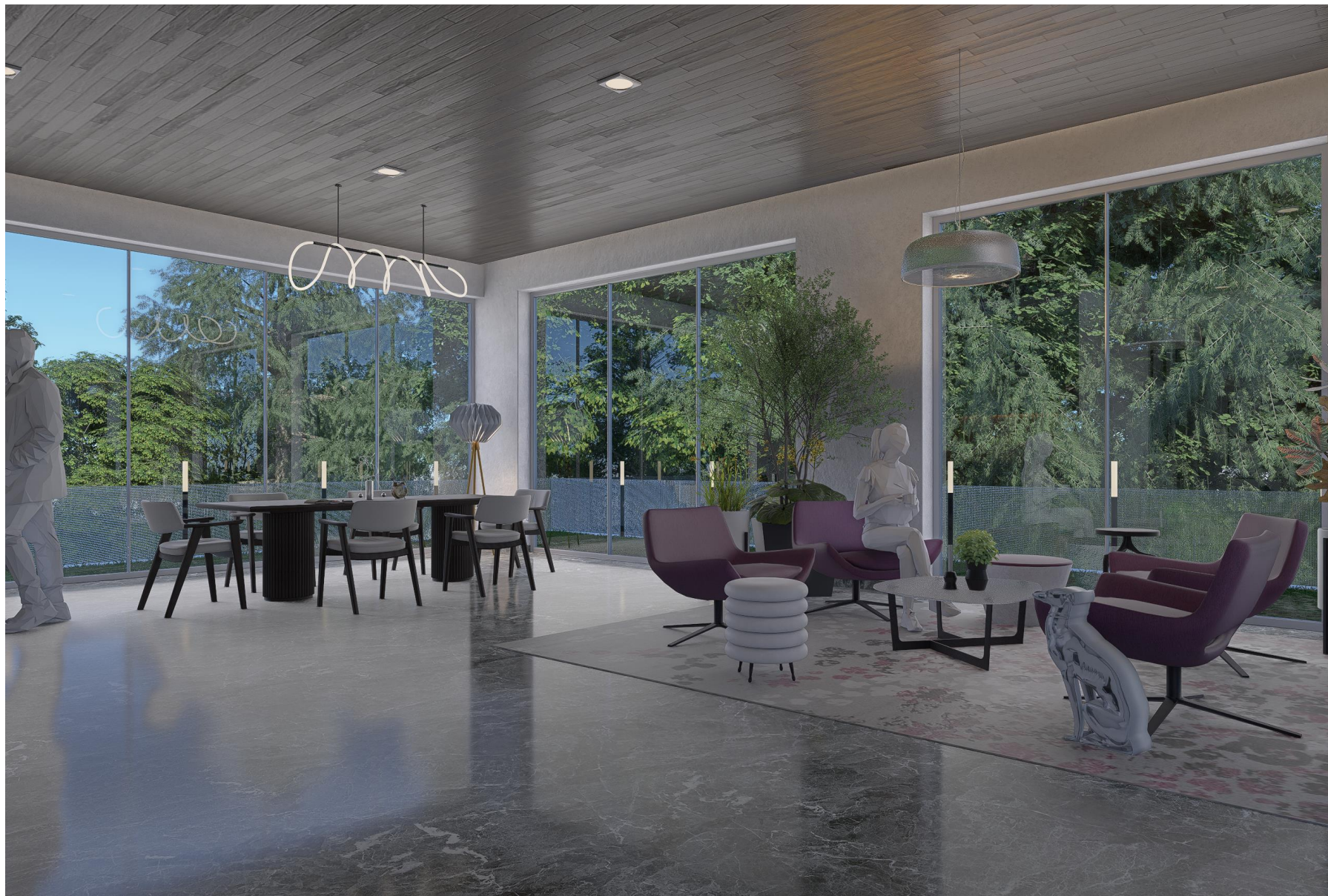
FF – LIVING