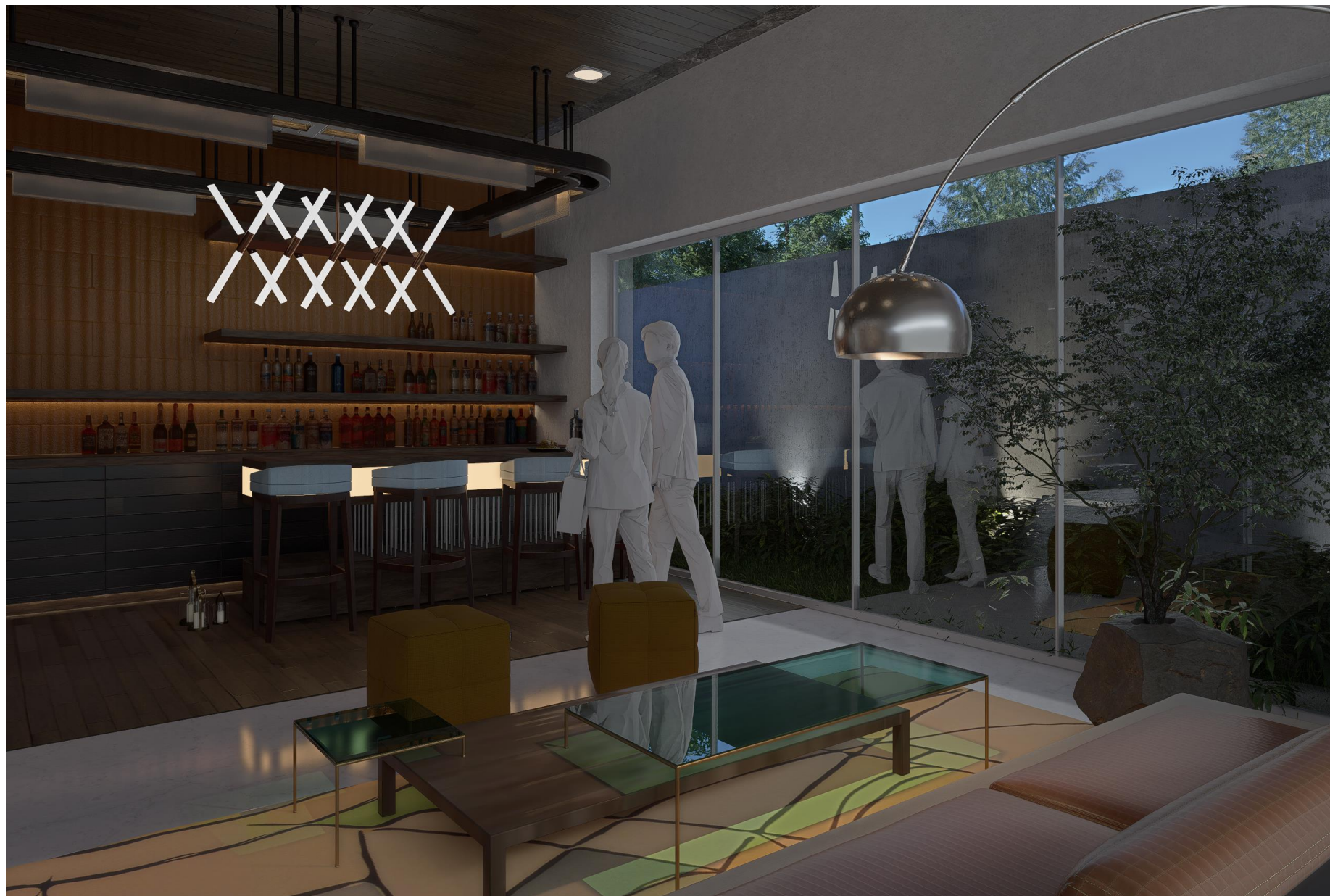
GF – MULTIPURPOSE HALL / BAR