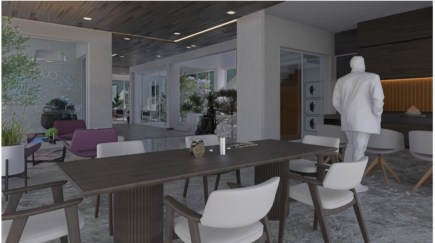
FF – DINING