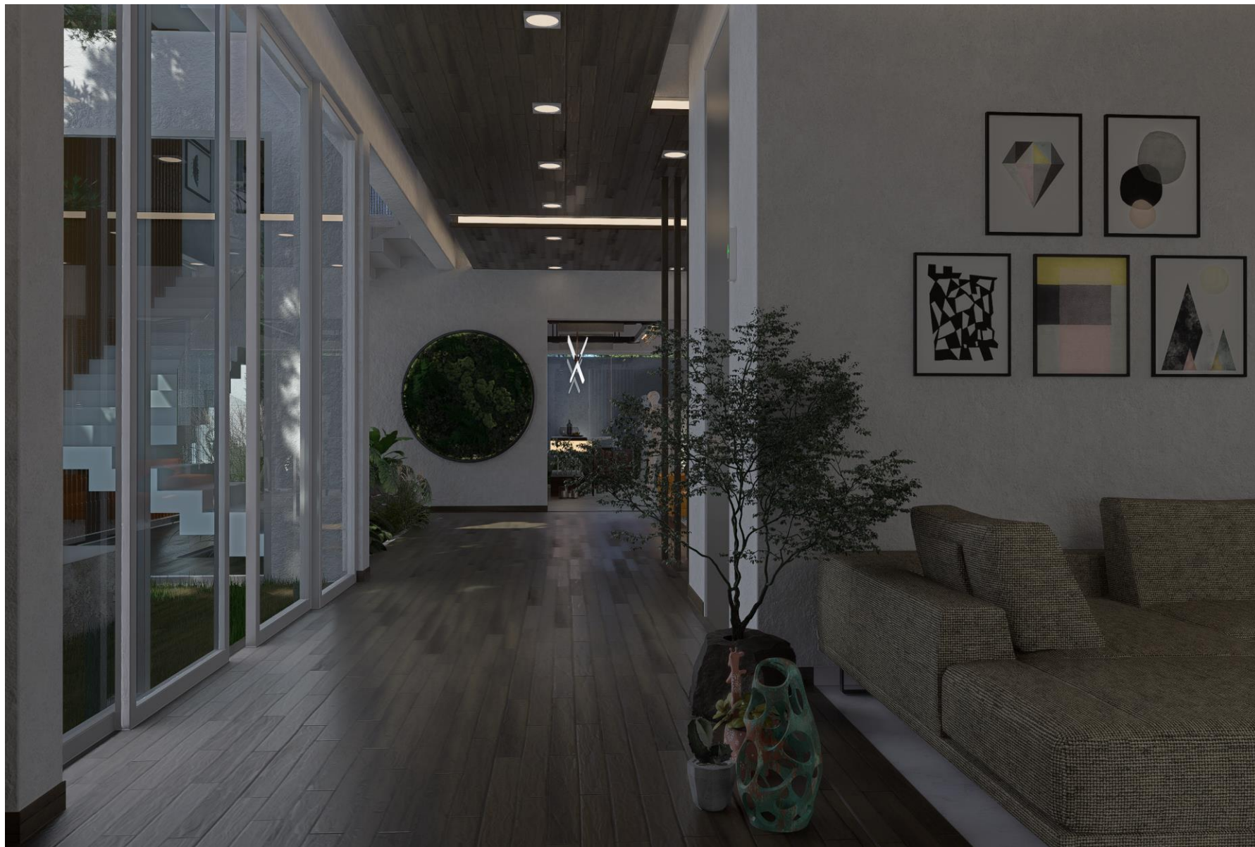
GF - CORRIDOR