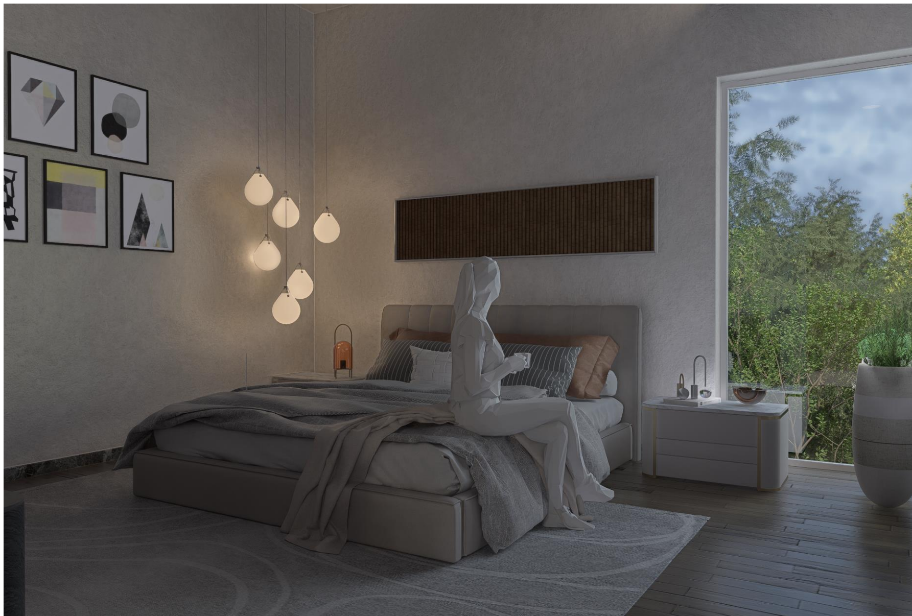
SF – BEDROOM