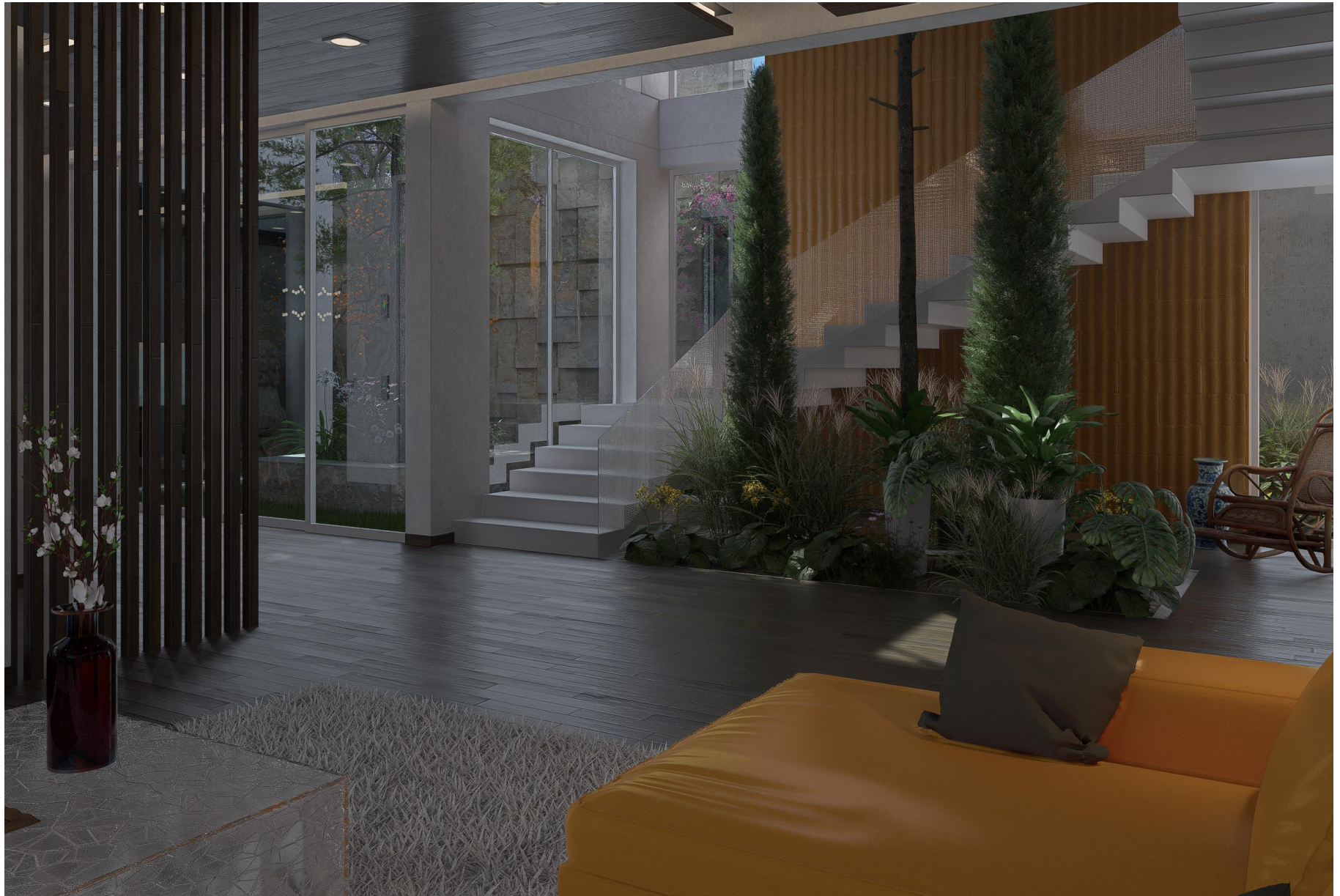
GF - STAIRCASE