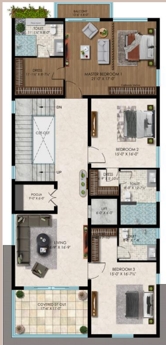
SECOND FLOOR PLAN Area – 2714 Sqft