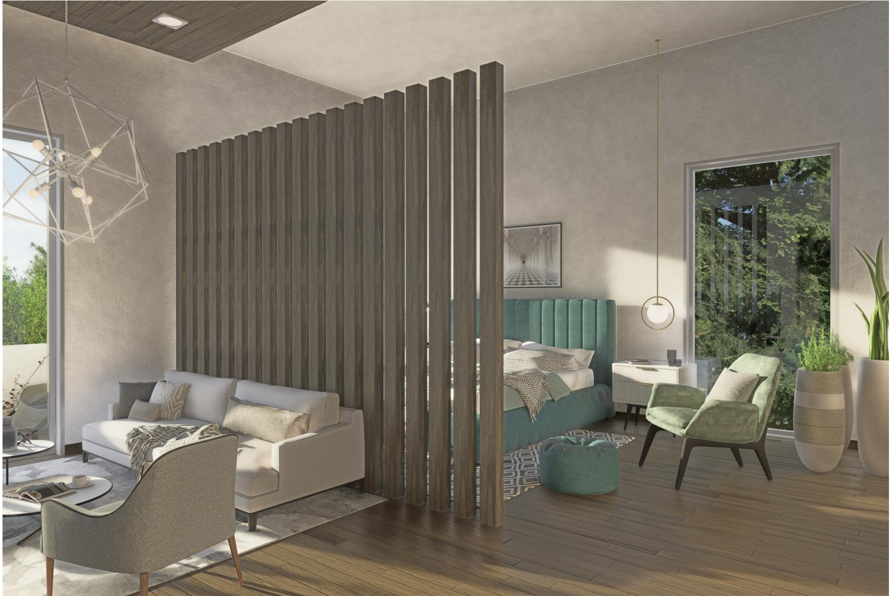
SF – MASTER BEDROOM