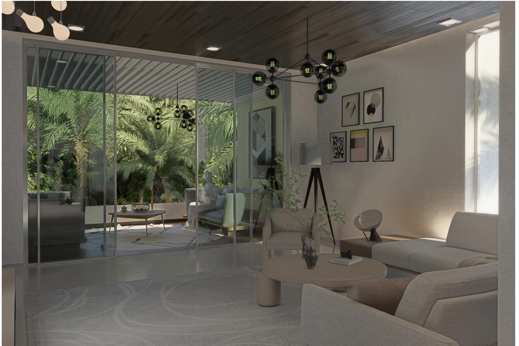
SF – LIVING