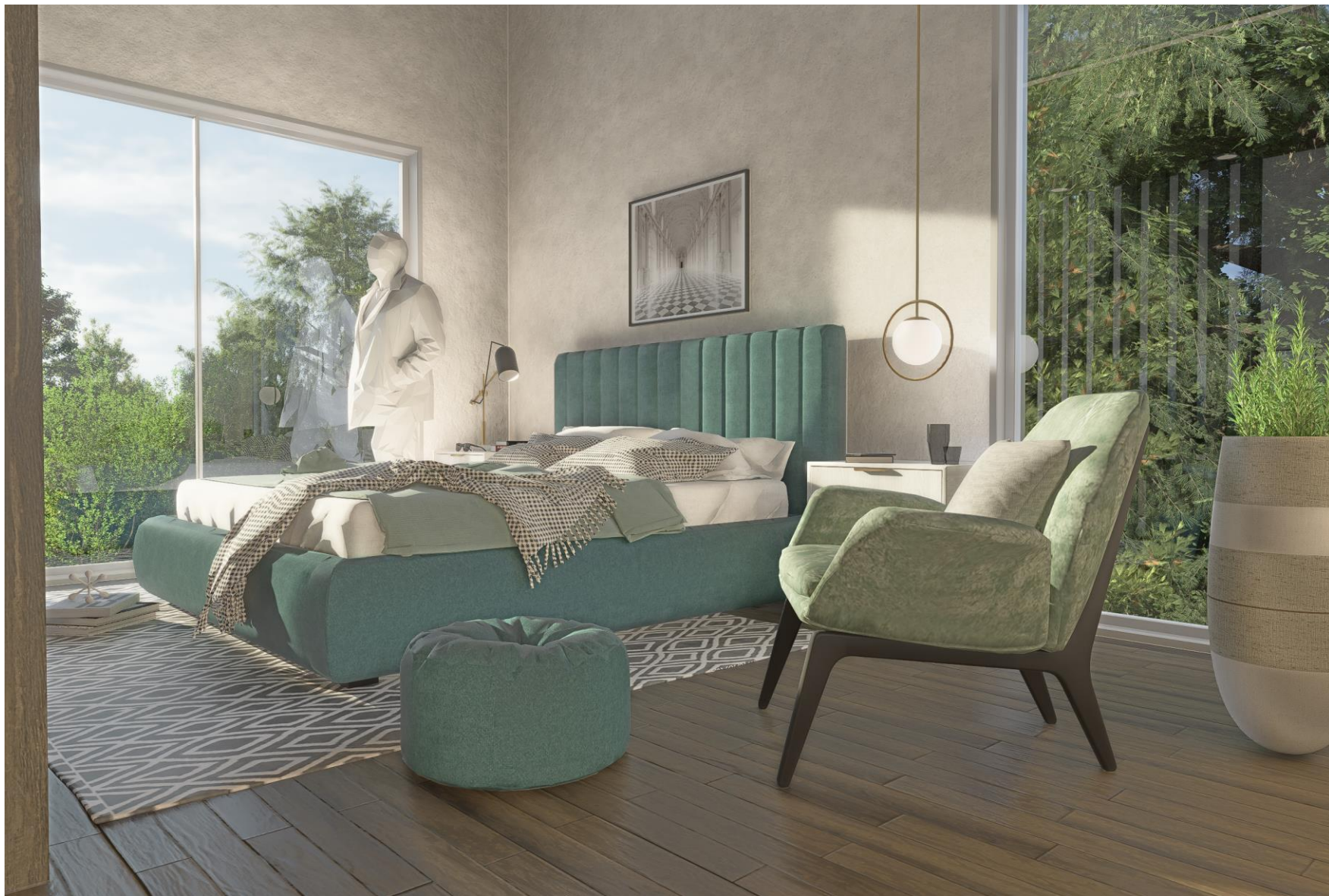
SF – MASTER BEDROOM