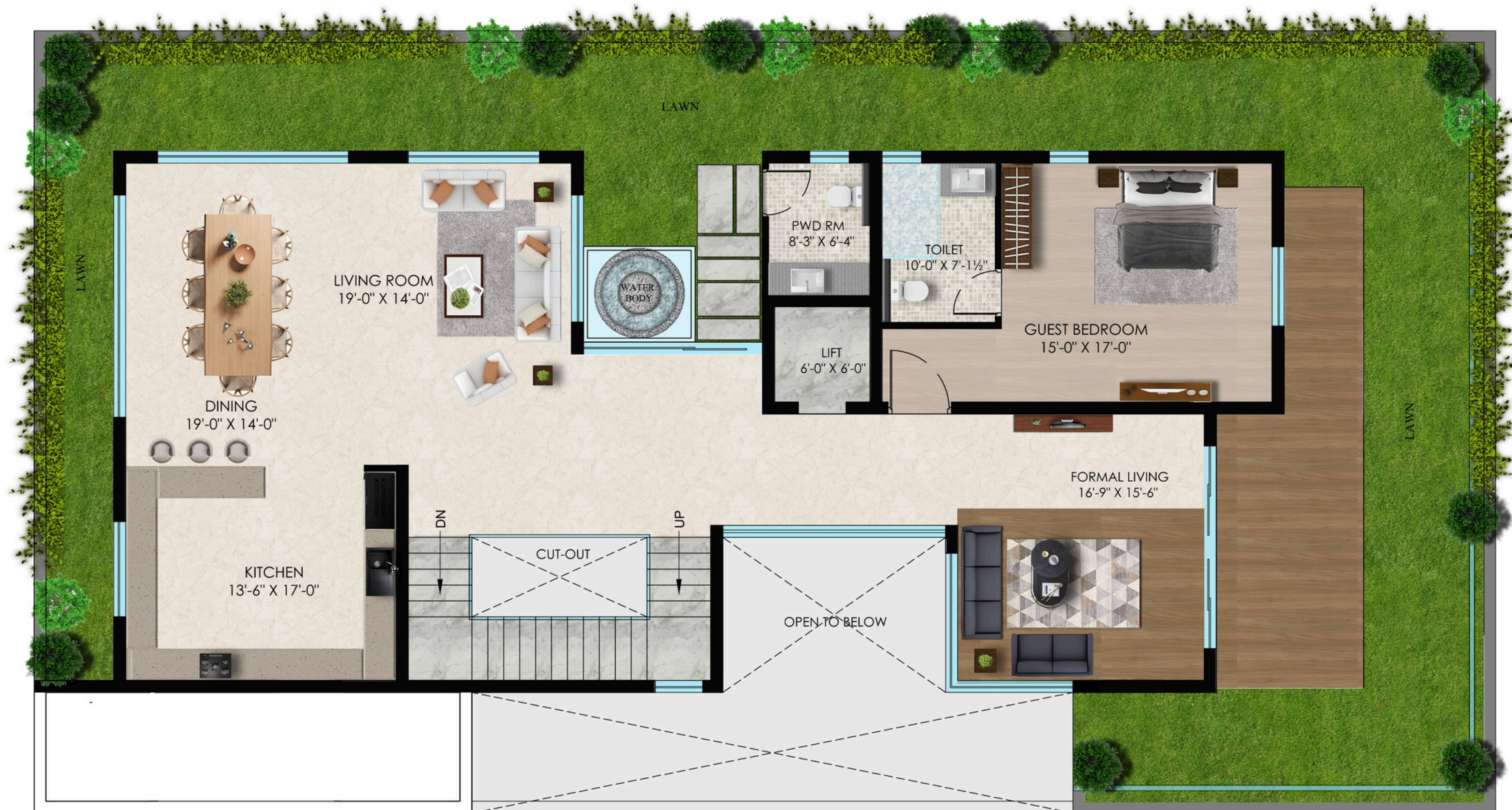
FIRST FLOOR PLAN - 2925 SFT.