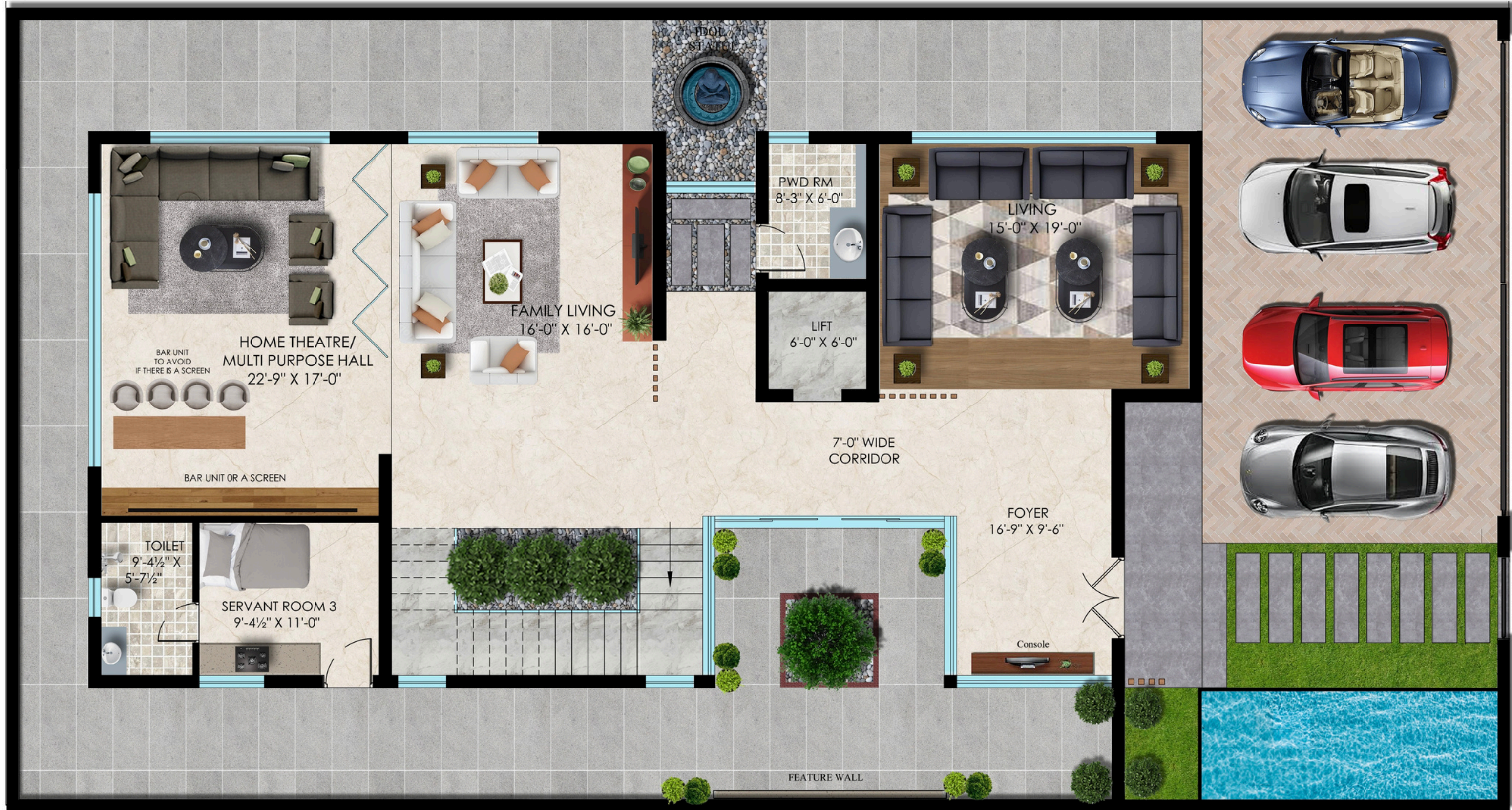
GROUND FLOOR PLAN - 4093 SFT.