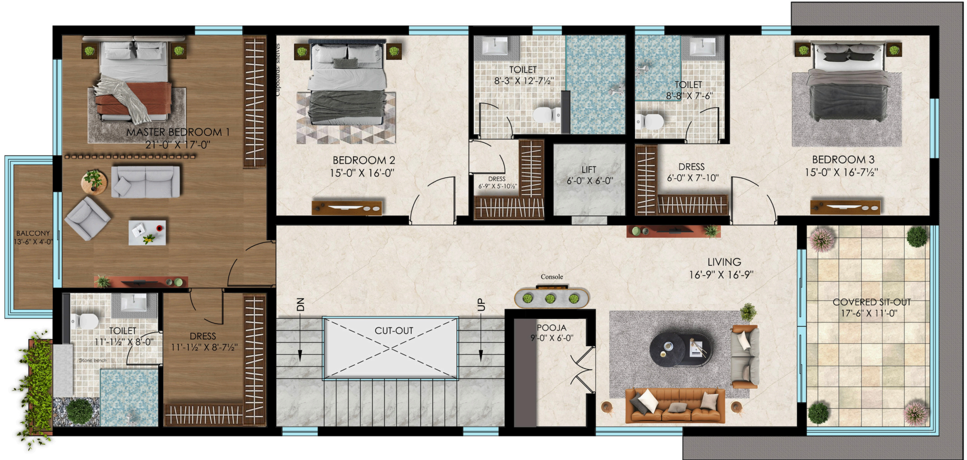
SECOND FLOOR PLAN - 2714 SFT.